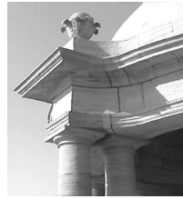
Jahangir Kothari Parade

Origins: The dome seems to have developed as roofing for circular mud-brick huts in ancient Mesopotamia about 6000 years ago. In the 14th century B.C. the Mycenaean Greeks built tombs roofed with steep corbeled domes in the shape of pointed beehives (tholos tombs). Otherwise, the dome was not important in ancient Greek architecture. The Romans developed the masonry dome in its purest form, culminating in a temple built by the emperor Hadrian. Set on a massive circular drum the coffered dome forms a perfect hemisphere on the interior, with a large oculus (eye) in its center to admit light.